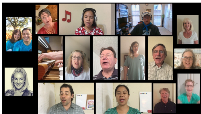
(Sanctuary Choir - View performance Here )

On September 20th, the Sanctuary Choir joined us for the first time in six months and led worship with "Beautiful Savior". What a great job they did! This was a true milestone for the CLC choir - our first-ever virtual worship leading! It was wonderful to have our choir back, and it is my goal to continue with making it possible for them to participate also in future services while physically distanced. Many thanks to everyone for their great singing! All are welcome, let me know if you want to join our choir's future virtual performances!